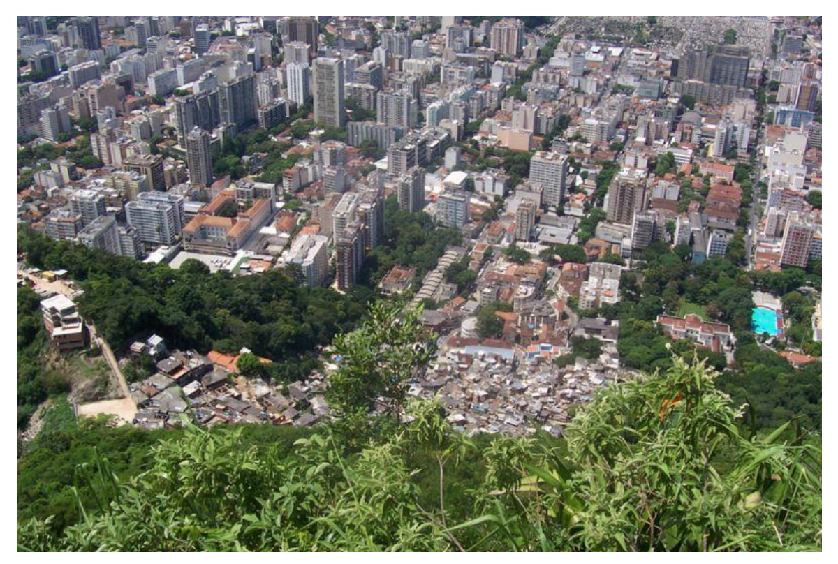
Document 1 – In the foreground, the favela of Dona Marta with, at the bottom, the suburb of Botafogo (Photography: N. Bautès, September 2007)

The urgency with which the city is confronted since then, certainly explains the fact that the first operations of the community-based police force in the favelas do not in any way replace but, rather, succeed to the more classic – and violent – methods of intervention of the police. Indeed, the favela of Santa Marta, which is situated at the centre of the Botafogo suburb in the south area (see Document 1), and which is one of the most favoured places of the city, has been the subject of a vigorous police invasion which was given a lot of media coverage, after which it was decided to place CCTVs in the streets.