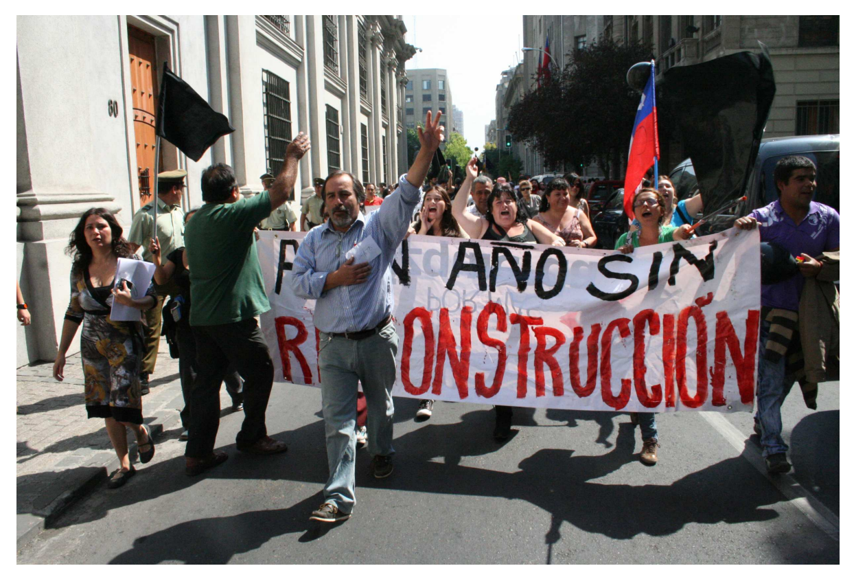
Figure 2. Demonstration of MNRJ and FENAPO "1 year without reconstruction" next to the presidential palace La Moneda in Santiago.

Many of these organizations participated in the "National Meeting: Citizens' experiences for just reconstruction" in Talca in January 2011. Two important events occurred during this meeting. First of all, the foundations of the first recommendations and citizen demands document were laid for reconstruction in a document entitled "[tr.] National Demand for Just Reconstruction" (MNRJ, 2011b) which was officially submitted to the presidential palace on March 7, 2011, one week