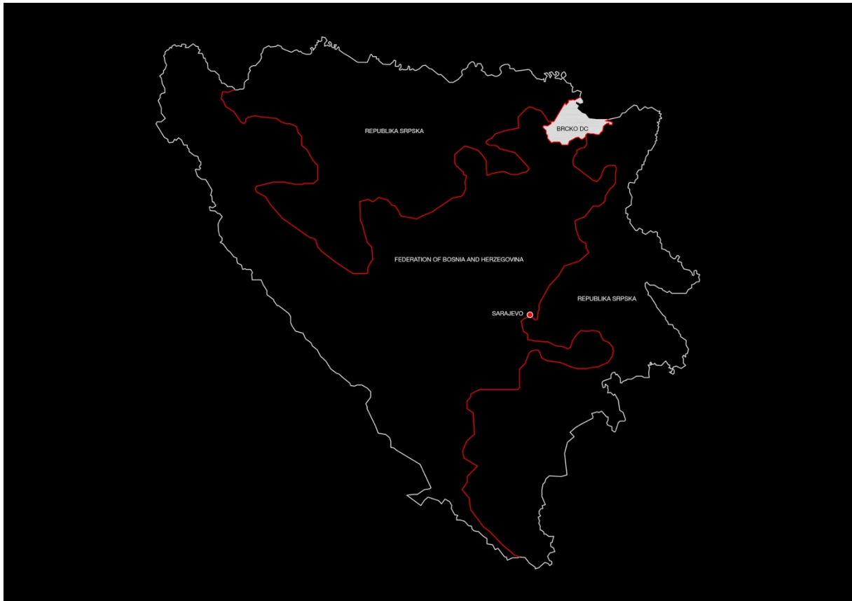
Figure 1: Map illustrating the position of the IEBL (shown in red) and the division of B&H into two entities and one district