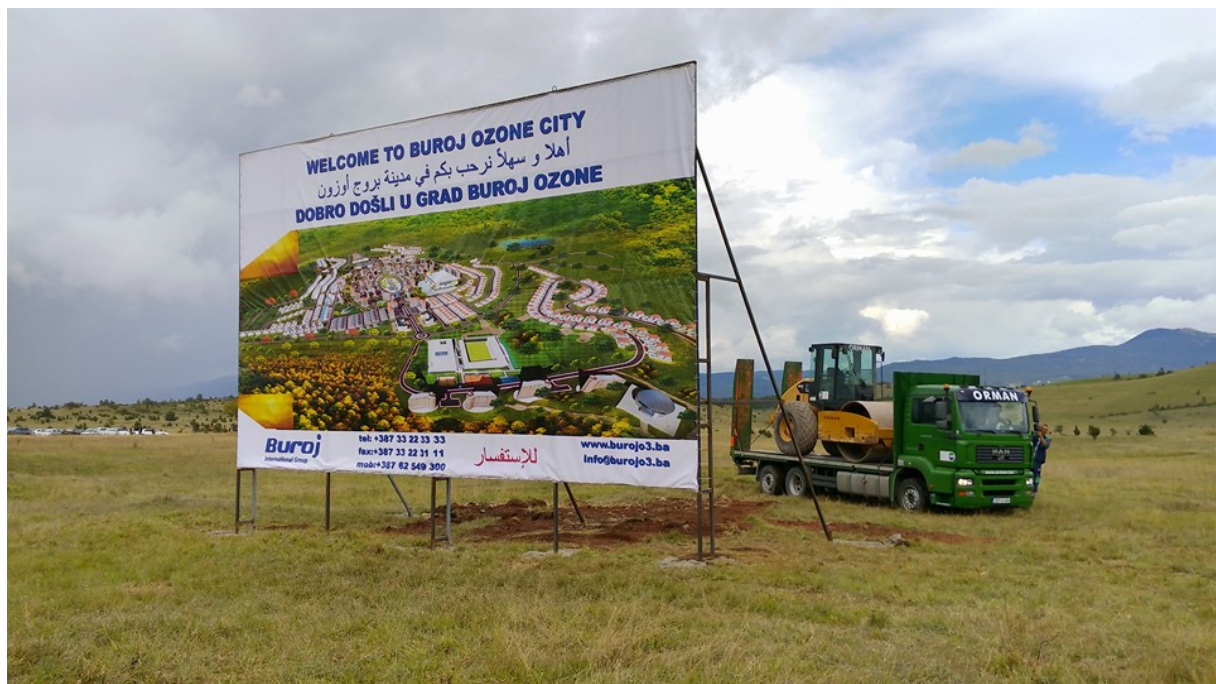
Figure 3: Buroj Ozone construction site opening in 2016

It should come as no surprise that by approximately 2012 this zone was already very much on the radar of developers from the Gulf in search of attractive locations in B&H. Eventually it was the Buroj Property Developers who came to an agreement with the local authorities in Trnovo to get a concession for 137 ha of land close to Dejčići village, and develop a so-called self-integrated tourist town, set to be the largest of its kind in South-Eastern Europe so far. Buroj Property Development was established in 2007 and describes itself as one of the “leading international property development companies in the United Arab Emirate Dubai” (Buroj International Group, 2021). Looking at the brief it is clear that this is an exceptionally ambitious undertaking. The proposal consists of 824 villas, 128 hotel/apartments, 36 buildings dedicated to different types of services, health centres and a hospital, a children’s ski centre, a zip-line, etc. It’s a new town that prides itself on being an “environmentally-conscious community with focus on sustainability and living in harmony with nature” (ibid.) (figure 3). This is rather ironic, considering the issues elaborated in the paragraphs above and in those to follow.