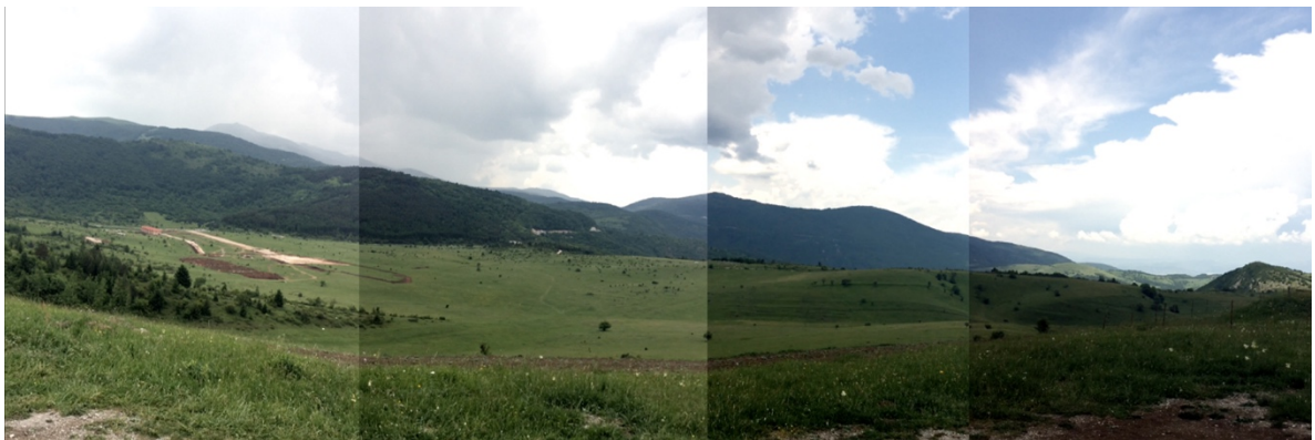
Figure 4: Prečko polje, Trnovo municipality in Sarajevo Canton, 2018

out in the “Environmental Protection Plan for Sarajevo Canton 2016-2021”, an official document commissioned by Sarajevo Canton and published in 2017. Although mandatory, no Environmental Impact Assessment study had been produced or submitted to the Federal Ministry for Environment and Tourism prior to producing or adopting the regulatory plan. The plan was adopted in December 2015. However, the public discussion, aimed at incorporating input from citizens and non-governmental bodies, was only held in January 2016, rendering the concept of citizen participation almost redundant. Regardless of the fact that it was being held post festum, the discussion generated much heat. The substantiated critique was directed at various issues, mostly to do with the inevitable adverse effects on the sanitary safeguard zones flanking the development site. However, no comments or suggestions from that meeting seem to have been taken on board, as the plan was not subjected to any further revisions or amendments.