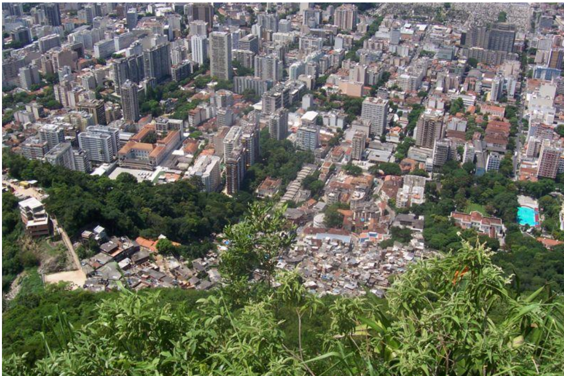
Document 1 – In the foreground, the favela of Dona Marta with, at the bottom, the suburb of Botafogo (Photography: N. Bautès, September 2007)

The urgency with which the city is confronted since then, certainly explains the fact that the first operations of the community-based police force in the favelas do not in any way replace but, rather, succeed to the more classic – and violent – methods of intervention of the police. Indeed, the favela of Santa Marta, which is situated at the centre of the Botafogo suburb in the south area (see Document 1), and which is one of the most favoured places of the city, has been the subject of a vigorous police invasion which was given a lot of media coverage, after which it was decided to place CCTVs in the streets.