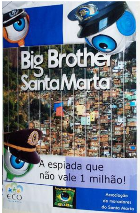
Document 2 – Poster elaborated by the residents’ association of the favela of Santa Marta criticising the implementation of a CCTV system in the streets 16

In another spatial context, on the western outskirts of the city, the suburb of Cidade de Deus, made up of several favelas and important multi-occupancy housing areas, was the second place to benefit from a UPP (2009). In this case, Cidade de Deus was selected as a priority due to its direct proximity to the Olympic complex under construction, and to its extensive media coverage in the early 2000s. Indeed, Cidade de Deus was made internationally famous due to its criminal violence which was illustrated in Fernando Meirelles’ 2002 film of the same name. However, the size of this suburb meant that the process to rid the place of armed drug traffickers took longer and was more violent than for Santa Marta.