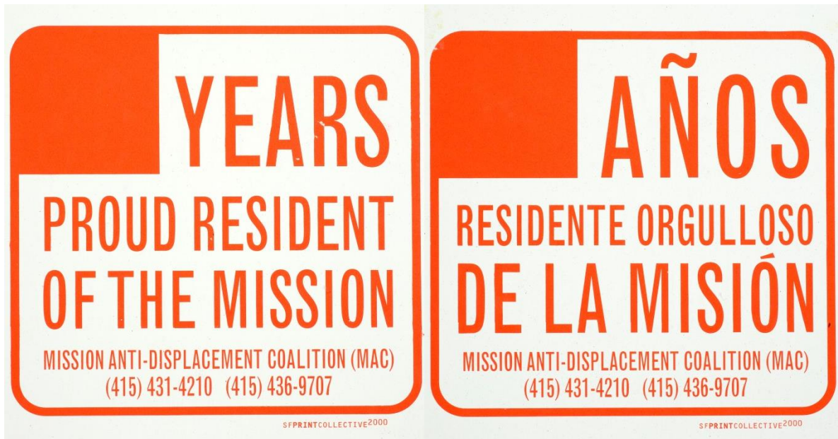
Figure 1: Residential Claims (Source: San Francisco Print Collective, reproduced with permission; www.sfprintcollective.com ): During the first dot-com boom the Mission Anti-Displacement Coalition (MAC) illustrated its support visually through the community by encouraging residents to put signs like this in apartment windows. Produced by the San Francisco Print Collective, which created a set of freely accessible posters that commented in the rise of gentrification, the set of images here raised claims of ownership and permanence, in Spanish and English.

Revendications des résidents (source : San Francisco Print Collective, publié avec autorisation, www.sfprintcollective ): Pendant le premier boum internet, la Mission Anti-Displacement Coalition (MAC) a lancé une campagne visuelle dans la communauté pour appuyer leurs revendications : les résidents étaient encouragés à afficher des posters comme celui-ci aux fenêtres de leur logement. Produite par le collectif San Francisco Print, cette série d'affiches, distribuées gratuitement, critiquaient l'accélération du processus de gentrification. Ici, le poster revendique, en espagnol et en anglais, le sentiment d'appropriation des habitants et de la permanence dans le quartier,