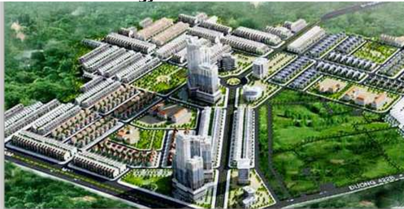
Illustration 3. Urban modernity, functional zoning and exclusivity: marketing strategy in new urbanized areas