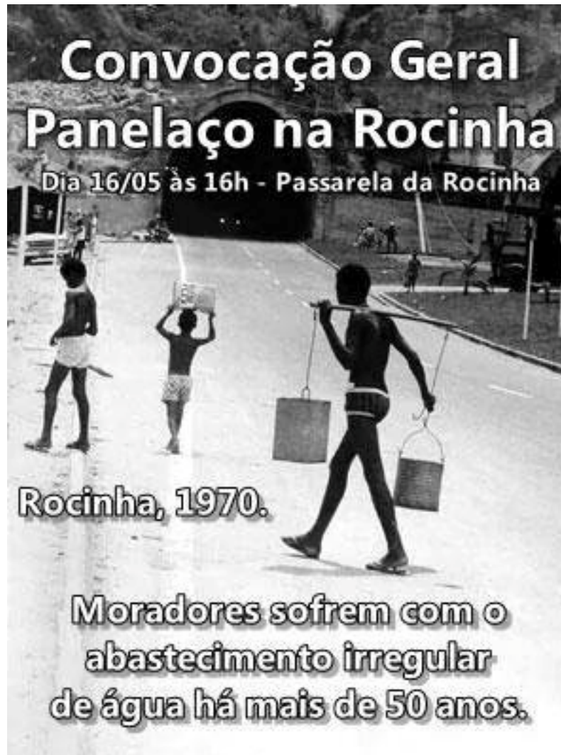
Illustration 3: Pamphlet calling residents to rally in Rocinha General invitation, on 16/05/2014, Passerelle de Rocinha. Rocinha, 1970, residents have been subjected to an irregular supply of water for the past 50 years

Nonetheless, the public authorities are increasingly advocating an inclusive participation model, and are desirous of seeing a link between the different protest movements and the public, as well as private services working towards the improvement of living conditions in the favelas. We recently saw discussions being organised between the residents, community leaders and the public authorities, although the presence of residents remained limited.