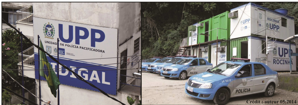
Illustration 1: UPP Posts in Vidigal and Rocinha, Justine Ninnin, 2014

In the field of public security, pacification works towards restoring certain fundamental rights that were previously limited in the favelas: the right to life, the right to freedom of movement, the right to property, access to justice, health, equipment and community services (Zaluar, 2013). Between 2012 and 2013, the Public Security Institute noted a decrease in homicides of 26,5 % in areas with UPPs, but an increase of 9,7 % in the rest of the city. We can nonetheless highlight the paradox of pacification which, on the one hand comes up as a means of providing peace, and on the other reflects a visual and discursive matrix of war, particularly