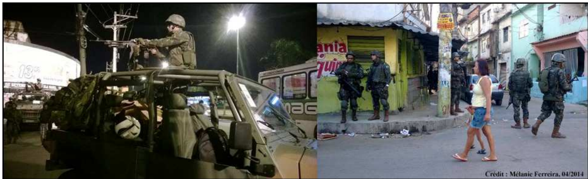
Illustration 2: April 2014, the army came in as reinforcement during the pacification of the favela complex of Marê, situated in the north of Rio de Janeiro.

The daily presence of armed police officers in the streets of pacified favelas, forces residents to adapt to new social rules and practices that, at the beginning, can provoke a certain resistance; what was previously resolved by criminal groups is resolved today by the police. The fact that police duties are being extended is disorienting for part of the population which is not sure what behaviour to adopt, in the face of police officers who are the holders of legitimate violence, mediators and sometimes educators even. There seems to be a transfer of governance responsibilities to UPPs. While for certain residents, the introduction of armed police officers in the public space, by day or night, ensures greater security, for others it is perceived as “military” intrusion in their daily life. It contributes to perpetuating the “ideological militarisation of public security” in urban space, i.e. “the transposition, in the public security domain, of the conceptions, values and beliefs of military doctrine, bringing about, within society, the crystallisation of a conception centred on the idea of war” (Silva, 1996, p. 501). As such, Graham (2012) observed a militarisation of the