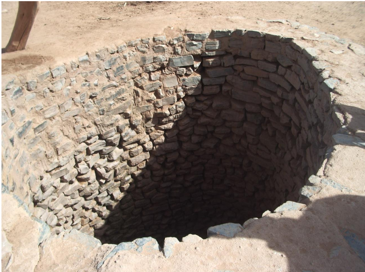
Photo 2: Traditional well in Alkhuriya, inside the area covered by Areva's mining permit at Imouraren.

What of the " fair and prior compensation " for the deprivation of pastoral rights of use provided for by Article 9 of the decree that created "home grazing territories"? How will the eviction and/or banning of some groups of nomadic and semi-nomadic Kel Tédélé, Kel Gharous and Ikazkazan Tuareg herders' from seasonal migratory routes and pastures used on the basis of traditional rights of use actually be implemented? These groups have at least one recognized "home grazing territory" with a well in it within the area covered by the mining permit granted to Areva. Located on the dynamite storage site, the well will necessarily be filled in.