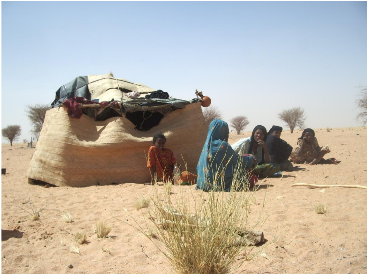
Photo 3: Nomadic Camp in Alkhuriya inside the area covered by Areva's mining permit at Imouraren

by the mining permit 25 . As our own fieldwork has confirmed, there are several camps using pastures in the area, even during the dry season.