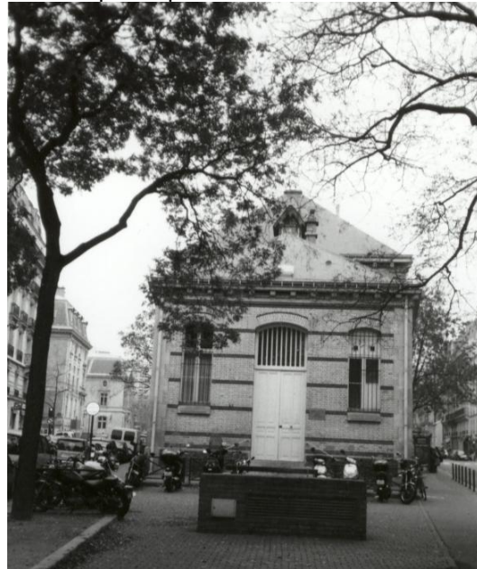
Photo 5 - Tribunal d'instance: court of first instance (Paris, Xve, 2005)

Striving to avoid the parallel with marriage, lawmakers settled on the district court, tribunal d'instance , a court that usually deals with petty claims and neighbourly conflicts. In addition, the PACS is recorded by a court clerk, a civil servant, and not by an elected representative of the people; not exactly a promising venue for enshrining a couple's rite of passage. With nothing to mark the event as a celebration or even a collective ritual, the way that the PACS is implemented smacks of bureaucracy, a far cry from the hopes and aspirations of couples who want to pledge their commitment to each other surrounded by their kin. The CRSH [Committee for the Social Recognition of Lesbians and Gays] in a statement declared itself to be