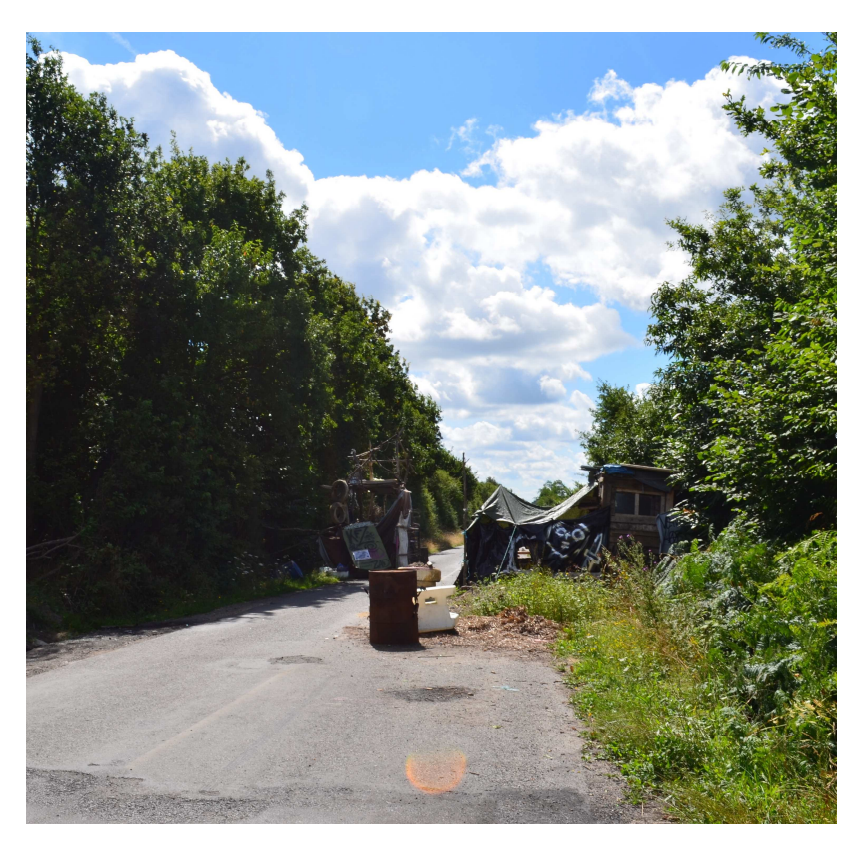
Illustration 2: A barricade: between a place for living and a place for the struggle. Anne-Laure Pailloux. August 2013.

and shacks, thus becoming "[tr.] as much a place for living as a place for the struggle". The situation forcibly created by the closing of this road by law enforcement authorities appeared to some as an opportunity to subvert its use. Of course, one of the issues behind this debate was the physical appropriation of the road, in the sense of control of the space. As a compromise, traffic-calming chicanes now run its length – passage is possible but slow – and they can quickly become barricades again (illustration 2).