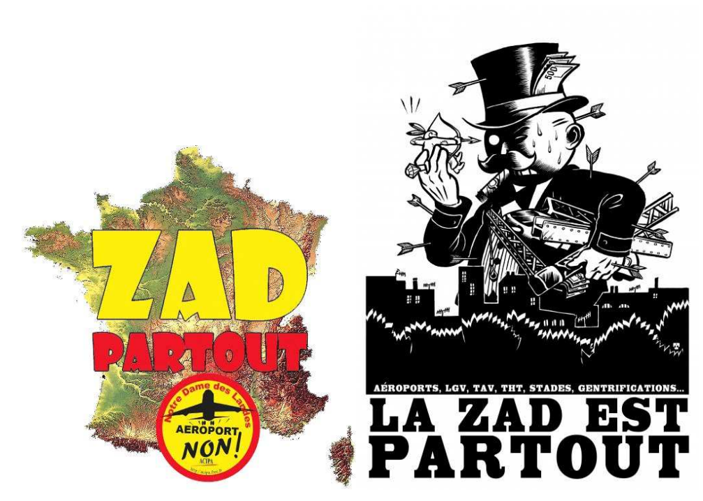
Illustrations 3 and 4: Examples of "ZAD partout" [tr. ZAD everywhere] posters.

[They were] anchored to the land, to the fields and other resisters, armed with new and methodical knowledge of the issues and a fierce obstinance. All these traits were woven together to create one fabric that was simultaneously a crucible and a refuge, a battleground for demanding a different way of life...And the more things happened, the more the acronym lost its original meaning. In its place, there was construction, friendships, moments of pure poetry, but also internal quarrels that were not always overcome, discordant voices, and suppressed distrust; and all that helped – through incessant meetings, heartfelt words, common practices, and solidarity in the face of a common enemy – to make this place into a Zone to be Protected" [translator's note: The acronym ZAD works in both cases in French: Zone d'Aménagement Différé and Zone À Défendre]. (Coordination, 2013: 4).