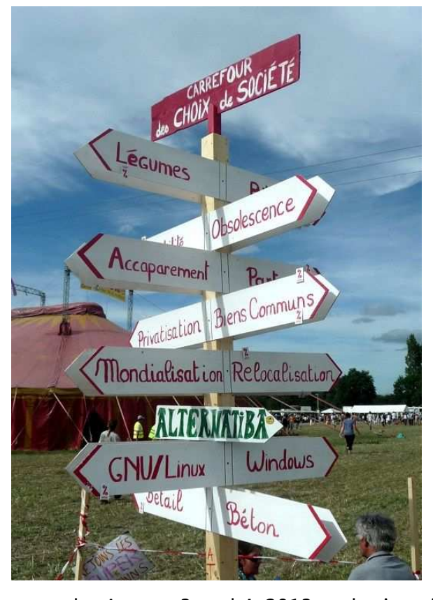
Illustration 6: Signage on the August 3 and 4, 2013 gathering site at Notre-Damedes-Landes.

The search for autonomy seems to be grappling with another problem: while "spaces of representation" of AGO opponents are focussed on rural space and its uses and purposes, the denounced "representations of the space" are determined by "the dominant space, that of the centres of wealth and power", i.e., urban space (Lefebvre, 2000: 61). Would autonomy in rural space then be through a change in the relationship with urban space?