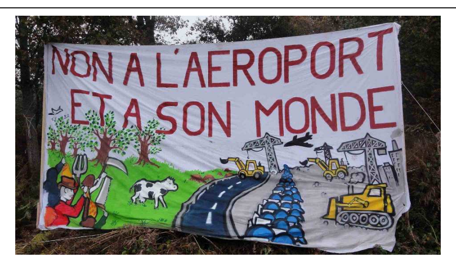
Illustration 5: Sign along a road during the re-occupation demonstration on November 17, 2012.