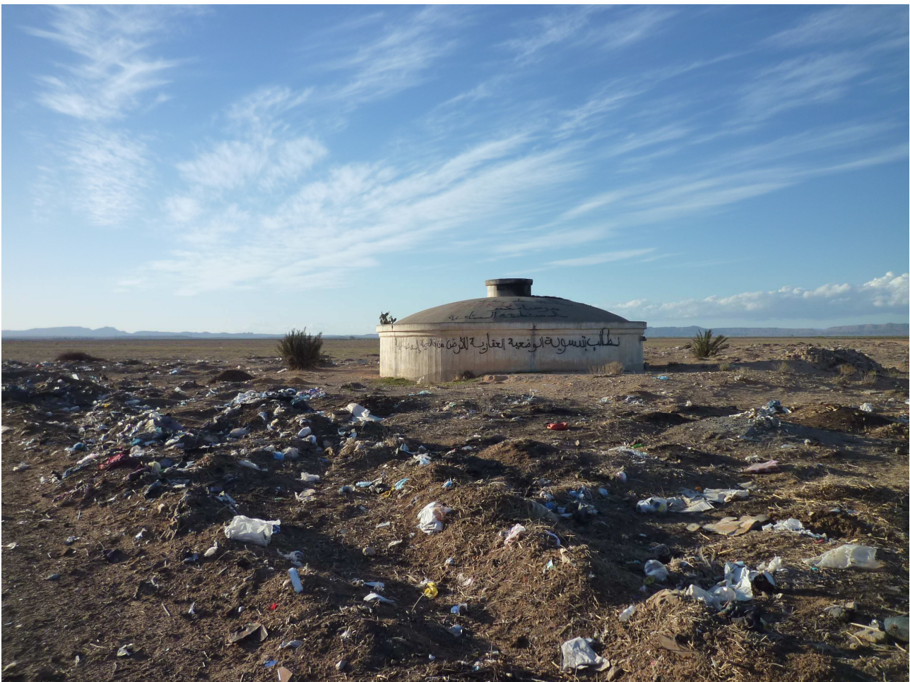
Photo 1: Ennasr, Maknassy (Fautras, 2013): Slogans: “Welcome to the industrial zone”, “We demand the regularisation of the situation of the land and its reallocation from agriculture to industry”

Note: The use of the agricultural estate land in the background has not been officially changed.