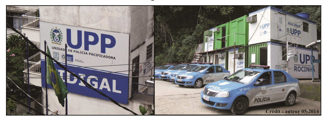
Illustration 1: UPP Posts in Vidigal and Rocinha, Justine Ninnin, 2014

In the field of public security, pacification works towards restoring certain fundamental rights that were previously limited in the favelas: the right to life, the right to freedom of movement, the right to property, access to justice, health, equipment and community services (Zaluar, 2013). Between 2012 and 2013, the Public Security Institute noted a decrease in homicides of 26,5 % in areas with UPPs, but an increase of 9,7 % in the rest of the city. We can nonetheless highlight the paradox of pacification which, on the one hand comes up as a means of providing peace, and on the other reflects a visual and discursive matrix of war, particularly