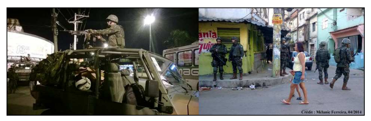
Illustration 2: April 2014, the army came in as reinforcement during the pacification of the favela complex of Marê, situated in the north of Rio de Janeiro.

The daily presence of armed police officers in the streets of pacified favelas, forces residents to adapt to new social rules and practices that, at the beginning, can provoke a certain resistance; what was previously resolved by criminal groups is resolved today by the police. The fact that police duties are being extended is disorienting for part of the population which is not sure what behaviour to adopt, in the face of police officers who are the holders of legitimate violence, mediators and sometimes educators even. There seems to be a transfer of governance responsibilities to UPPs. While for certain residents, the introduction of armed police officers in the public space, by day or night, ensures greater security, for others it is perceived as "military" intrusion in their daily life. It contributes to perpetuating the "ideological militarisation of public security" in urban space, i.e. "the transposition, in the public security domain, of the conceptions, values and beliefs of military doctrine, bringing about, within society, the crystallisation of a conception centred on the idea of war" (Silva, 1996, p. 501). As such, Graham (2012) observed a militarisation of the