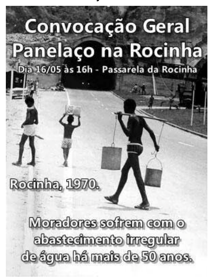
Illustration 3: Pamphlet calling residents to rally in Rocinha General invitation, on 16/05/2014, Passerelle de Rocinha. Rocinha, 1970, residents have been subjected to an irregular supply of water for the past 50 years

Nonetheless, the public authorities are increasingly advocating an inclusive participation model, and are desirous of seeing a link between the different protest