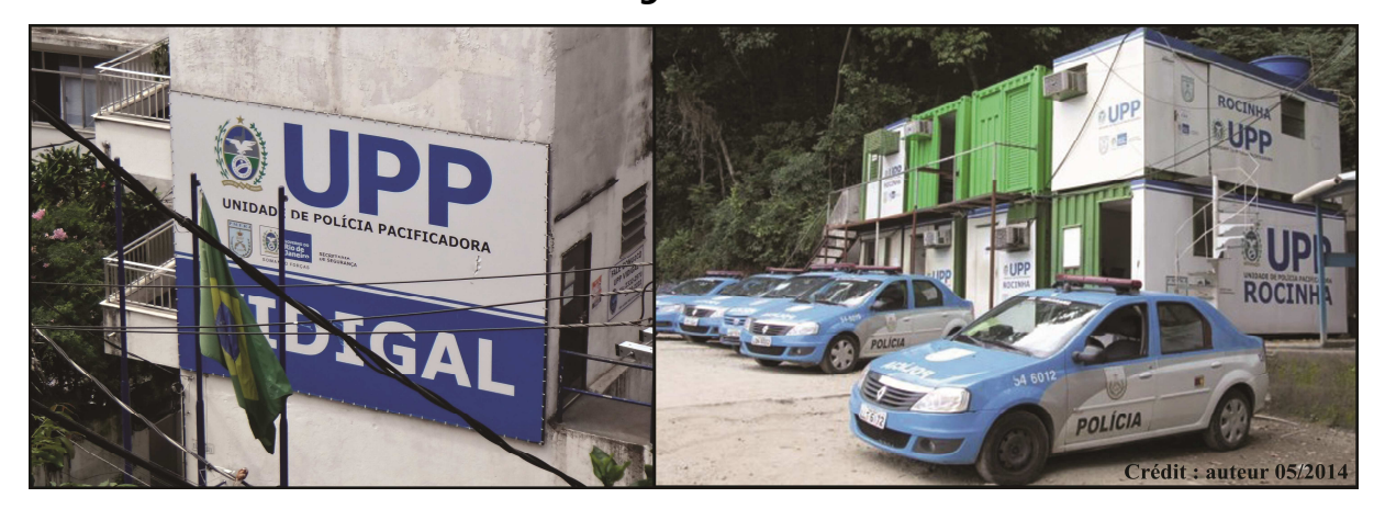
Illustration 1: UPP Posts in Vidigal and Rocinha, Justine Ninnin, 2014

In the field of public security, pacification works towards restoring certain fundamental rights that were previously limited in the favelas: the right to life, the right to freedom of movement, the right to property, access to justice, health, equipment and community services (Zaluar, 2013). Between 2012 and 2013, the