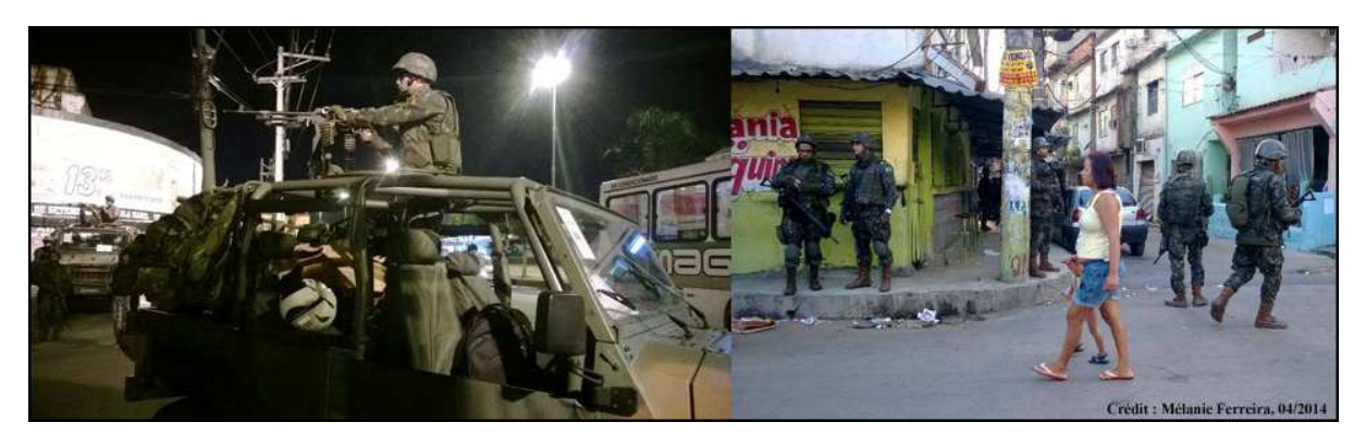
Illustration 2: April 2014, the army came in as reinforcement during the pacification of the favela complex of Marê, situated in the north of Rio de Janeiro.

The daily presence of armed police officers in the streets of pacified favelas, forces residents to adapt to new social rules and practices that, at the beginning, can provoke a certain resistance; what was previously resolved by criminal groups is resolved today by the police. The fact that police duties are being extended is disorienting for part of the population which is not sure what behaviour to adopt, in the face of police officers who are the holders of legitimate violence, mediators and sometimes educators even. There seems to be a transfer of governance responsibilities to UPPs. While for certain residents, the introduction of armed police officers in the public space, by day or night, ensures greater security, for others it is perceived as "military" intrusion in their daily life. It contributes to perpetuating the