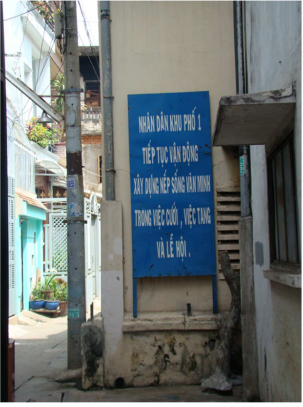
b) dans un quartier de ruelles héritées (district de Phú Nhuận)