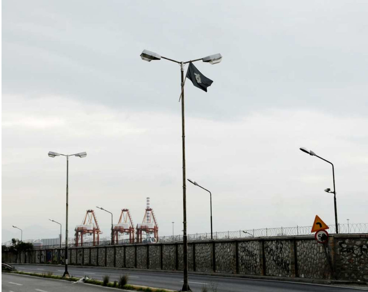
Figure 2. A Golden Dawn flag flutters from a lamppost near the industrial port between Keratsini and Perama.