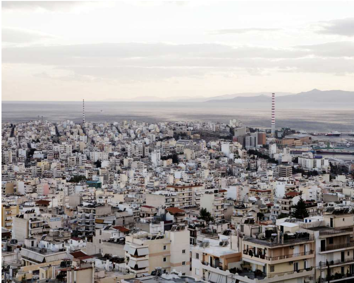
Figure 1. Keratsini.