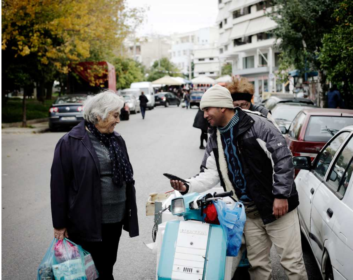
Figure 6. On the markets, elderly women are the Egyptian fish sellers' best customers.