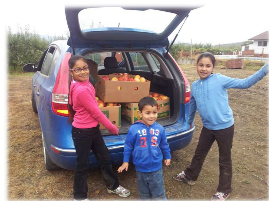
Image 3: Getting the apples ready to deliver to local charities in Kelowna (OFTP, 2015).